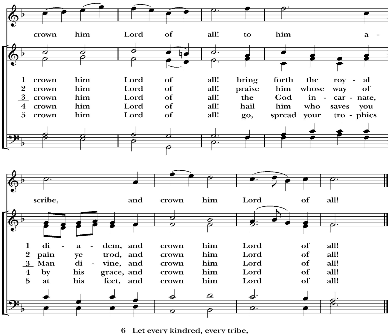
Let every kindred, every tribe, on this terrestrial ball, to him all majesty ascribe, and crown him Lord of all!