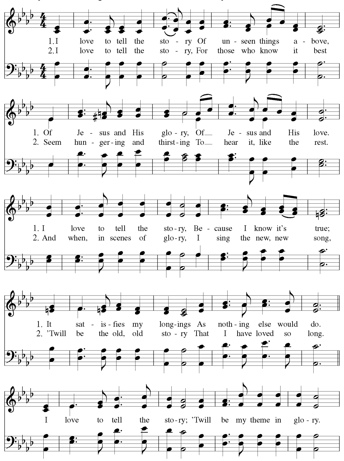
Lift Every Voice and Sing II - #64 I Love To Tell the Story