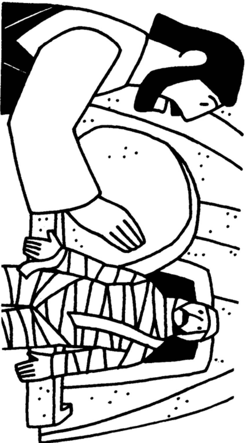
From The Complete Bible Story Clip Art Book. ©Gospel Light. Used by permission.